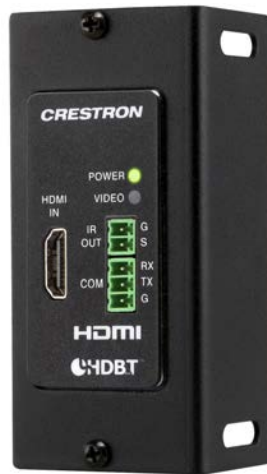
DM-TX-4KZ-100-C-1G-B-T with Surface-Mount Bracket (Included)

Power via the DM connection can be used to power the DM-TX-4KZ-100-C-1G. The device can also be powered using the optional PW-2407WUL wall mount power pack (sold separately).